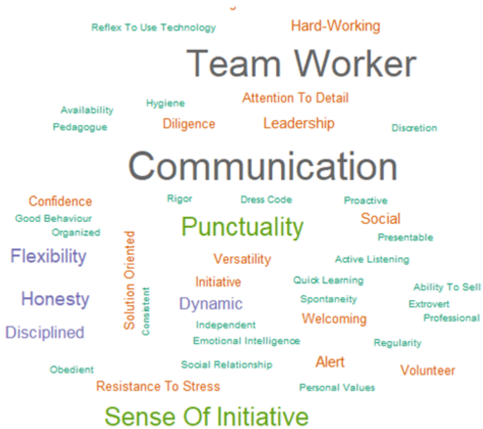
Figure A1: Soft skills that employers look for when making a hiring decision